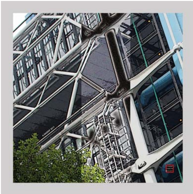
Centre Pompidou 80x80cm graphics on paper