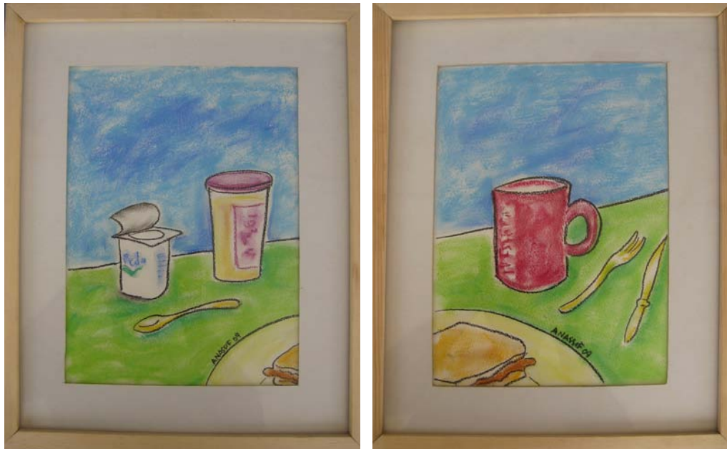
2 pieces Breakfast and Lactel, each 21x30cm, pastel on paper – Home.

BeauSite Hotel Art Exhibition "Father & Son" – Marsa Matrouh 1997 , Participated with my father with several paintings material (oil, pencil and pastel).