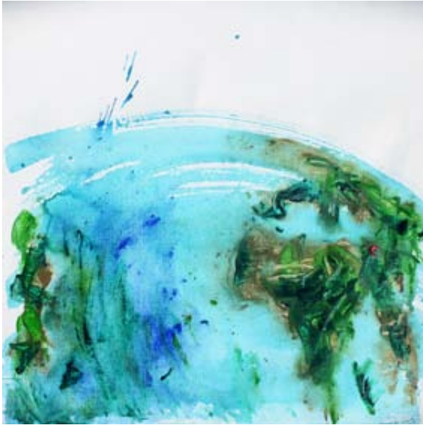
Tsunami Globe 50x50cm Acrylic on Canvas.

My International experience was the “Dialogue bleu et vert” Art Exhibitions then modified with some extra graphic pieces about “vision of centre Pompidou” – 12 rue Du Parchamp 92100 Boulogne Billancourt, France. From 30 June to 11 July 2011. Creating my latest line of art using the blue & green photographs with graphic combination related to the Pompidou Centenaire a Paris as well as some acrylic paintings on white — The artist has been chosen to represent Egypt in the Azmy Organization member of the ICOM in Paris in the cultural exchange between SHONA Egypt and Europe.